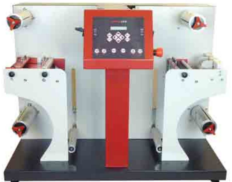
LF3 - Complete digital finishing system

Its far easier and cheaper with digital.