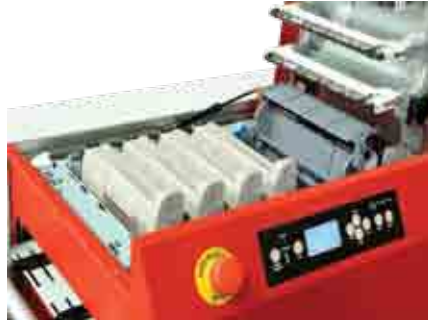
Quick toner cartridge change system