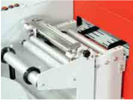
SecureTrack® - perfect media tracking